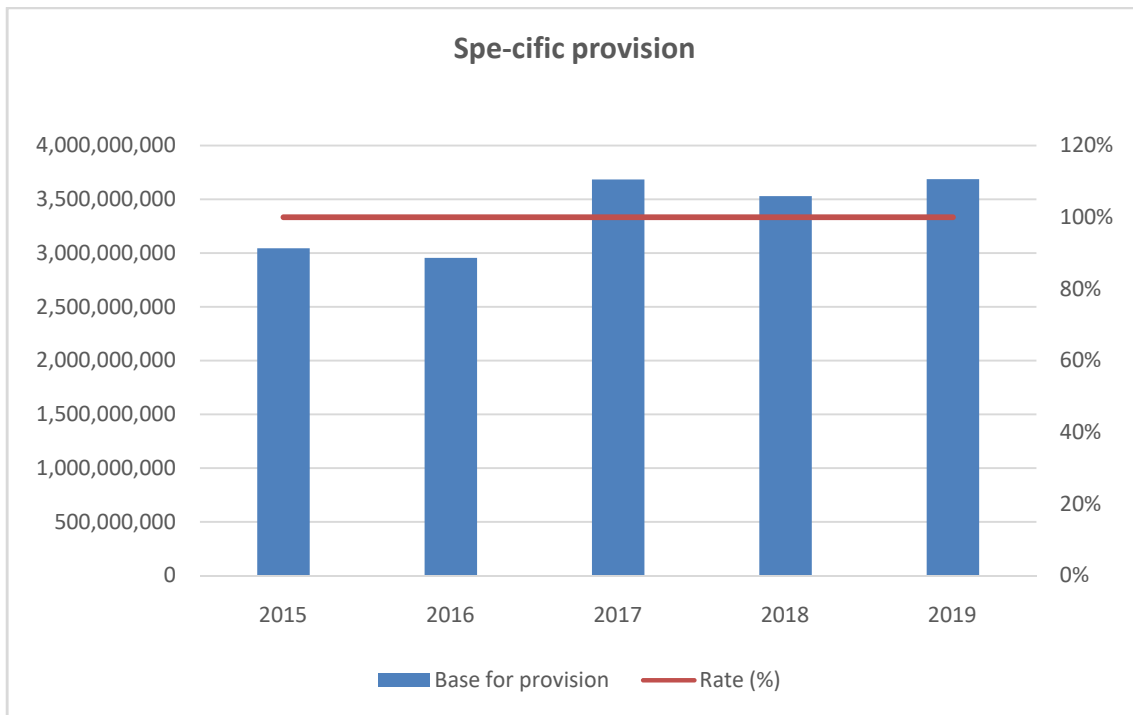
Figures: 4.2 Specific provision